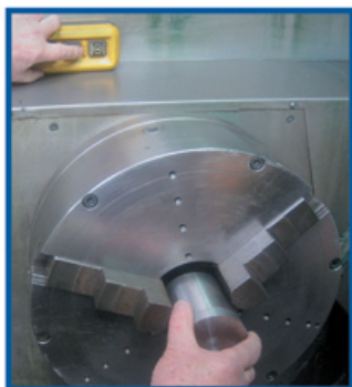
Pneumatic or hydraulic rotating cylinder power clamping 3 mm. stroke for each jaw

Continuous working-time action of the rotating cylinder provides an exceptional, consistent grip, which firmly secures the workpiece.